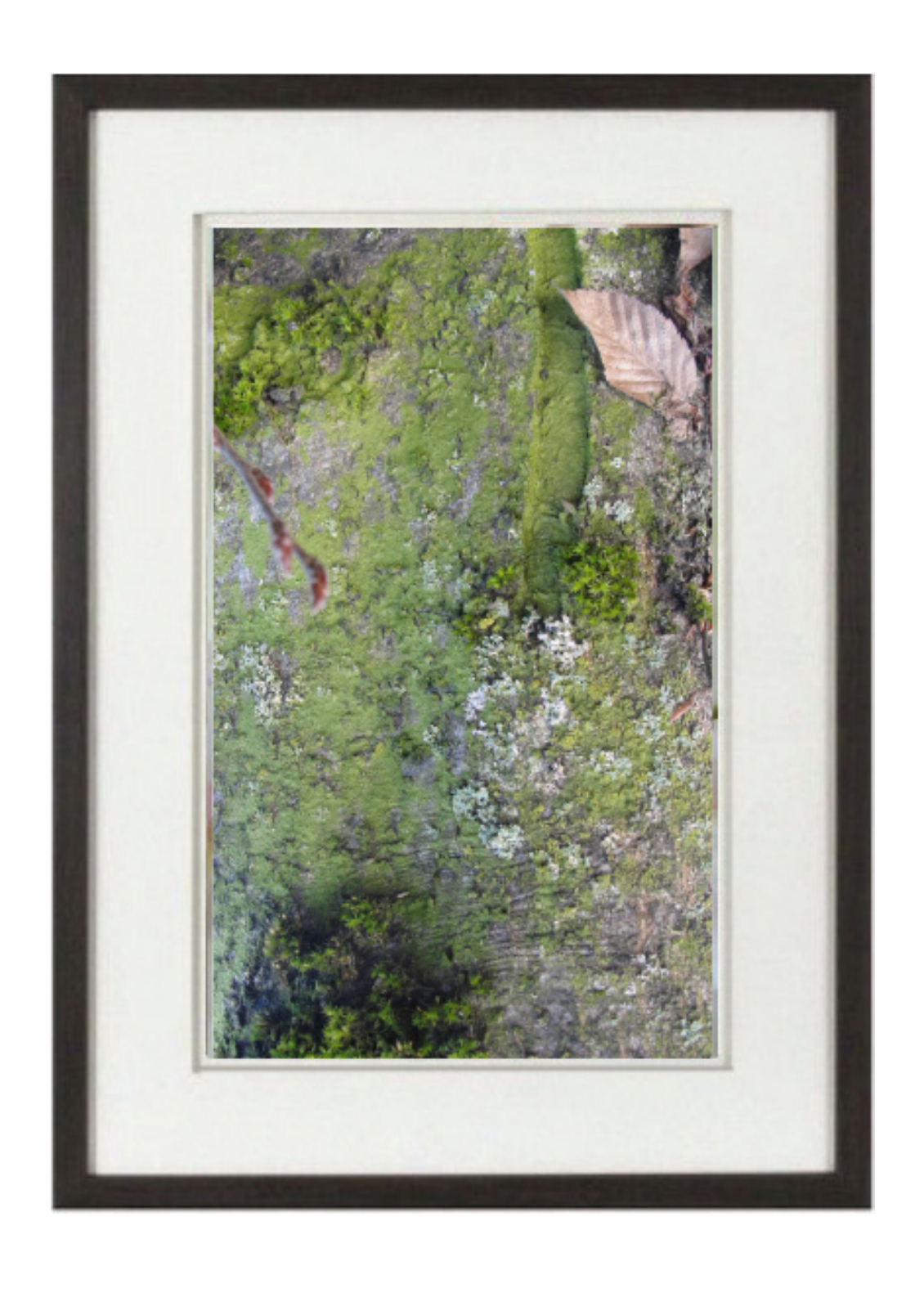
Sketchbook Communications: art murals