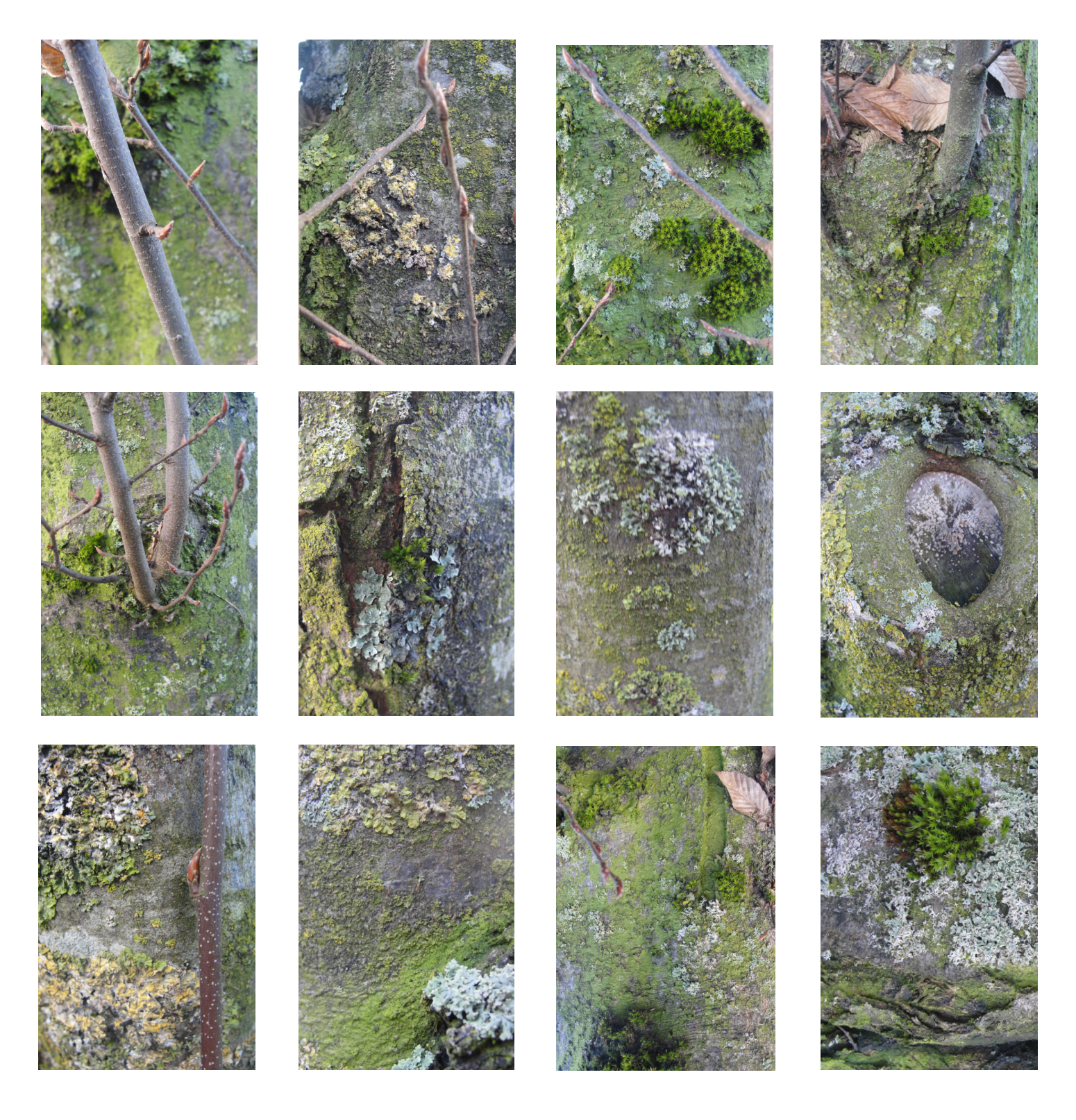
Sketchbook Communications: art murals